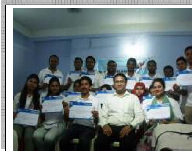
LEVEL 1 PARTICIPANTS, 18 (March Batch)