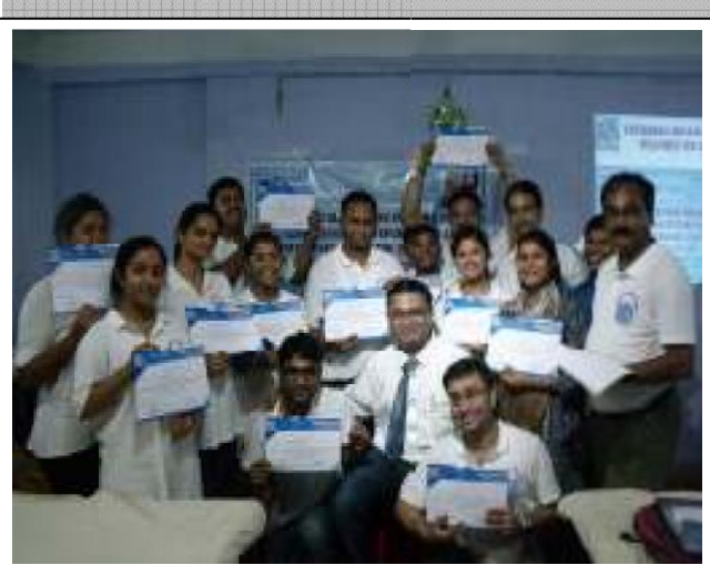
LEVEL 2 PARTICIPANTS, 18(July Batch)